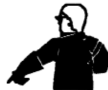
Hazard in road