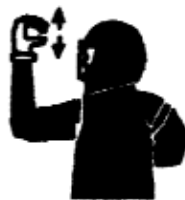
Blinkers are on